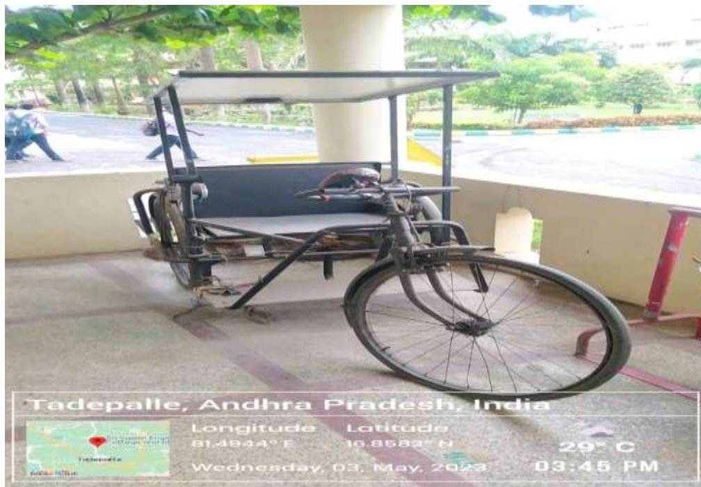
Solar Panel enabled Chair with battery to move