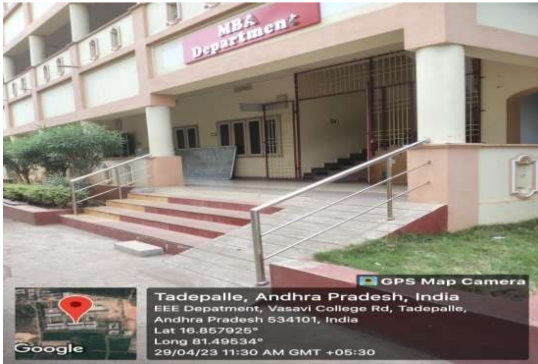
MBA Department with a ramp & railing: