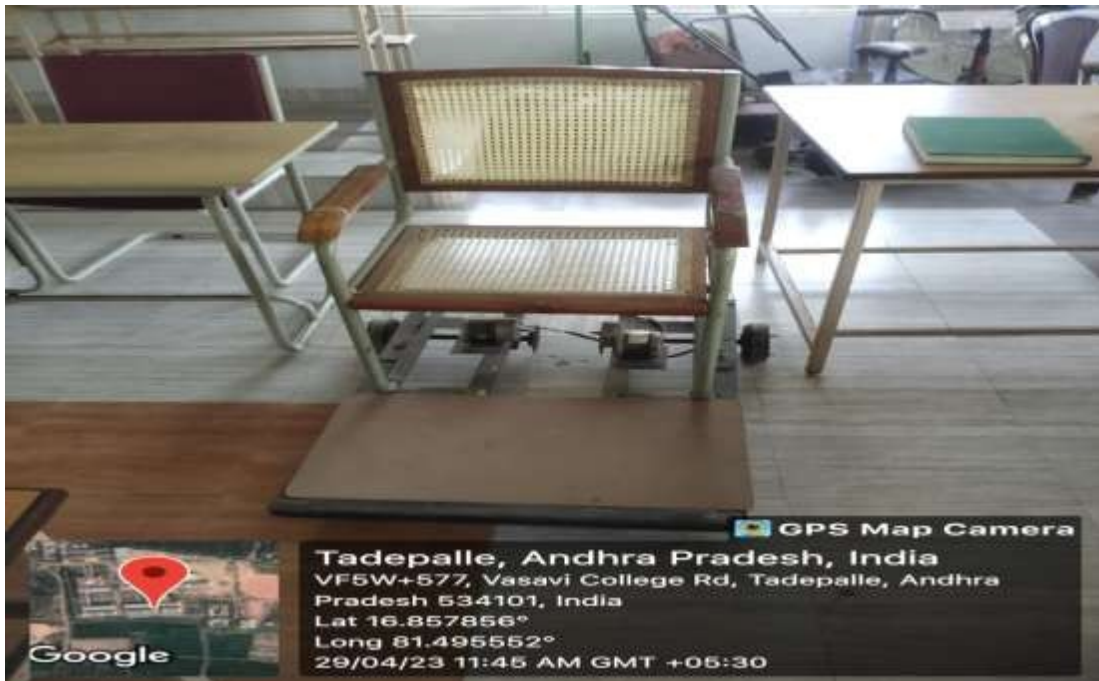
Chair attached motors and battery enabled to move

EEE department developed mechanized equipment for moving in the campus from department to department.